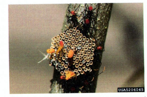
Wheel bug eggs and nymphs