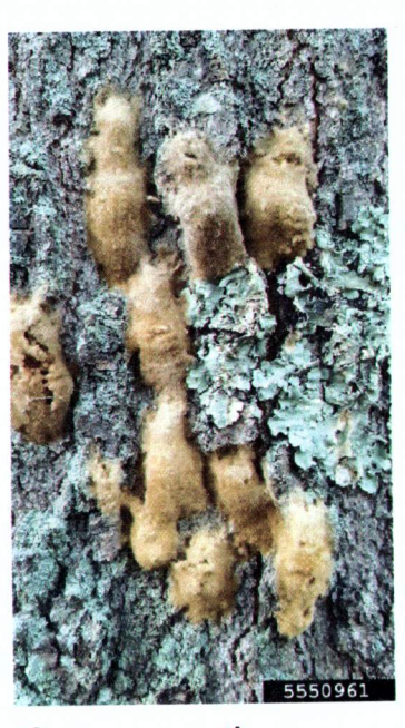
Gypsy moth egg masses are covered with brown hairs.