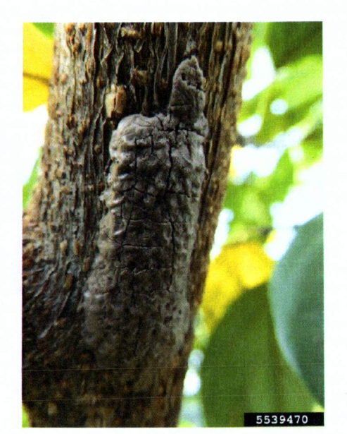
Spotted lanternfly egg mass

Egg masses of the spotted lantern fly, Lycorma delicatula (White), are usually covered with a smooth tan to gray colored coating when fresh. This coating may crack and fall off with age, exposing eggs laid in vertical rows underneath. Some egg masses are laid with only some or no covering at all. Here are a few other insect egg masses found in Virginia to help you recognize those of the spotted lantern fly. Sizes not to scale.