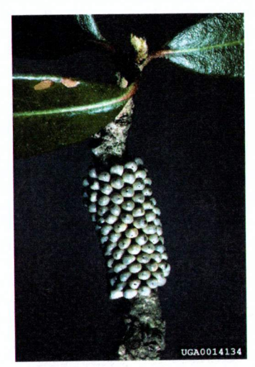
Buck moth eggs