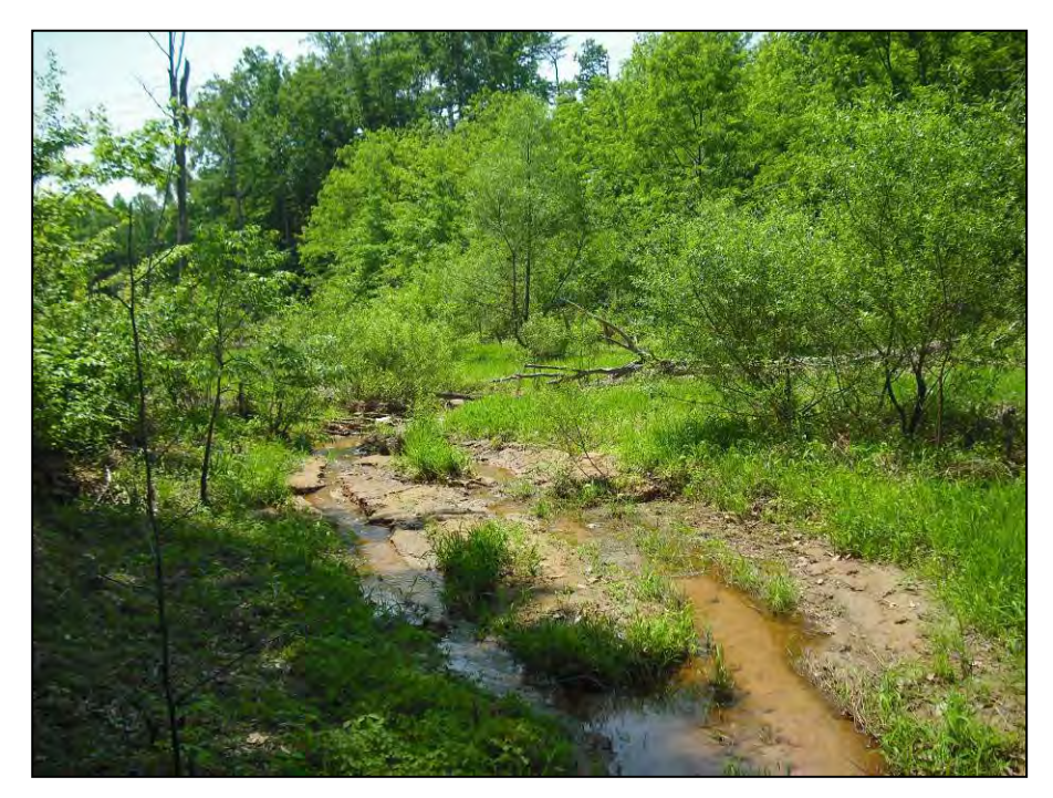
Photo 352: Deposition of sand and silt in the lower portion of Reach 665-C.