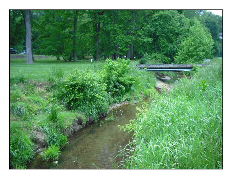
Photo 744: Loss of riparian buffer through the Medal of Honor Golf Course along Reach 690-A.