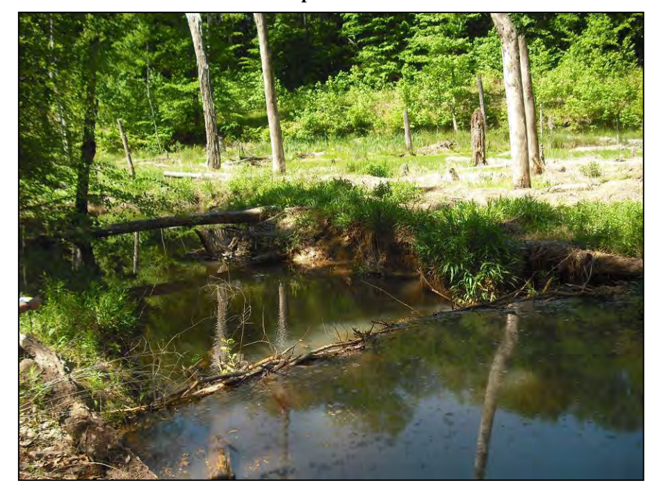
Photo 227: Large beaver dam acting as natural, de facto grade control on Reach 665-A.