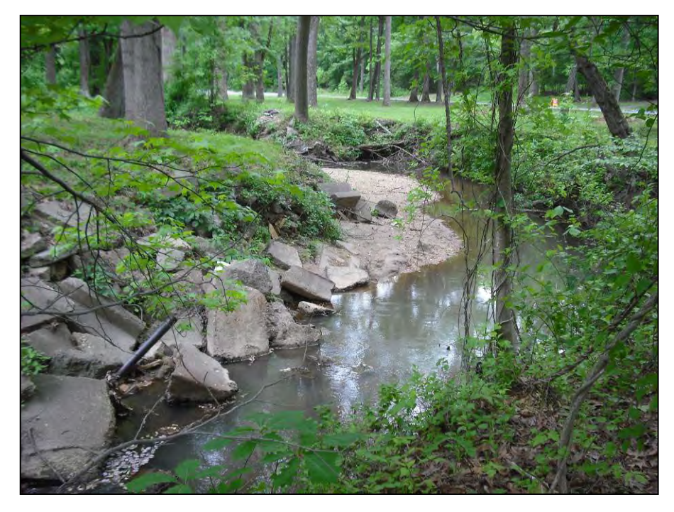
Photo 686: Concrete rubble bank armoring in response to channel erosion along Reach 650-A.