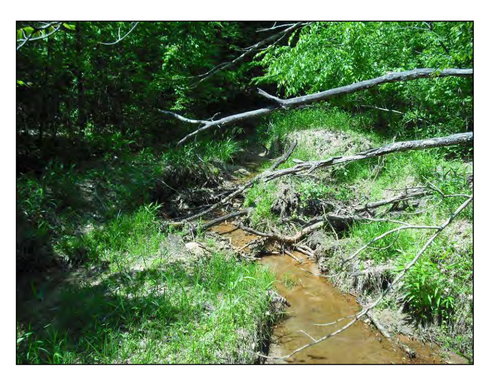
Photo 356: Water quality impairment approaching the downstream end of Reach 665-C.