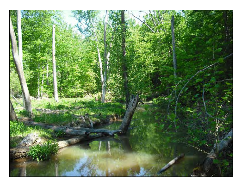
Photo 228: Backwater conditions upstream of a beaver dam on Reach 665-A.