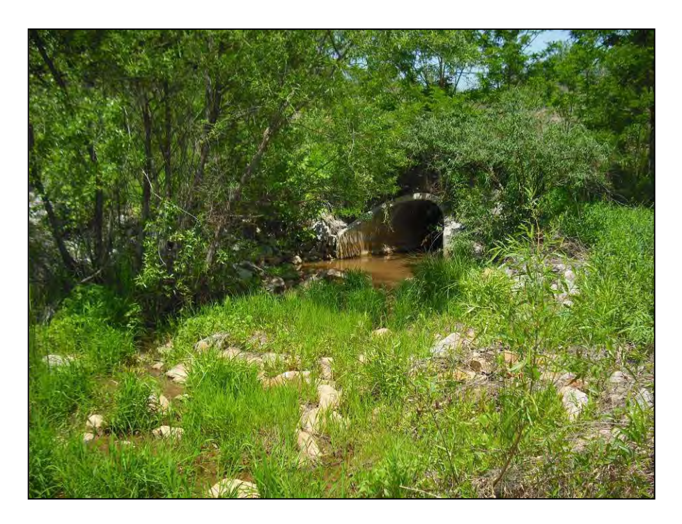
Photo 347: Concrete pipe outfall at the upstream end of Reach 665-B.