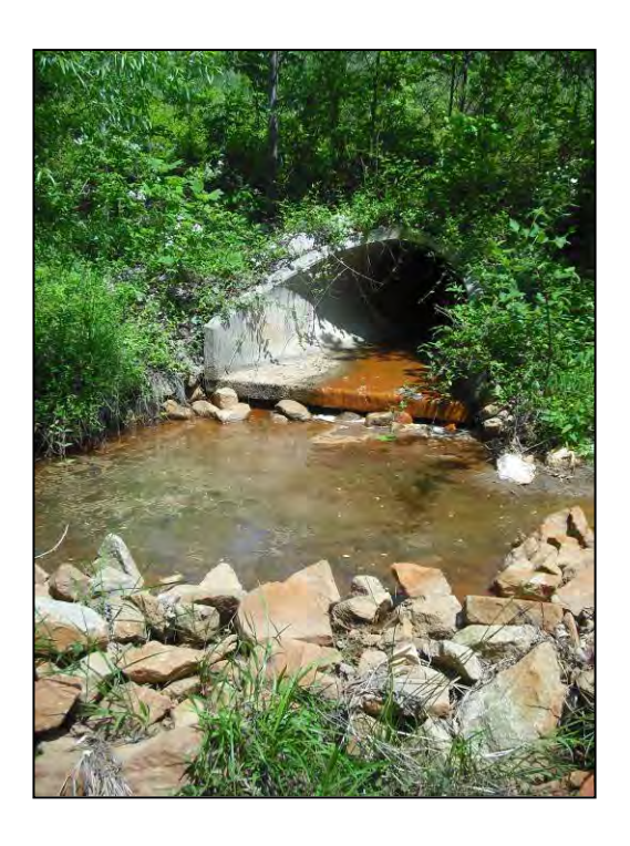
Photo 371: Concrete pipe outfall at the upstream end of Reach 665-C.