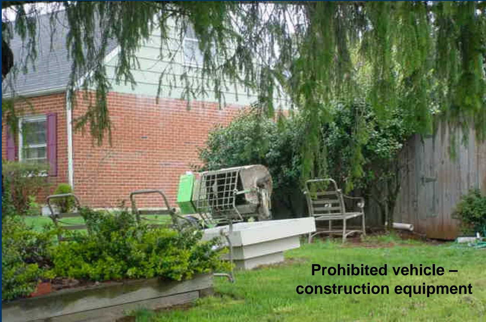
Prohibited vehicle – construction equipment