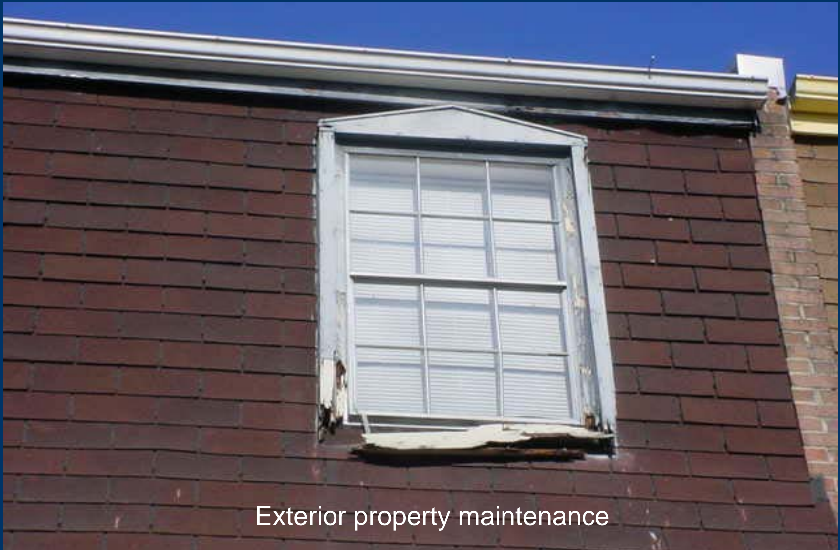
Exterior property maintenance