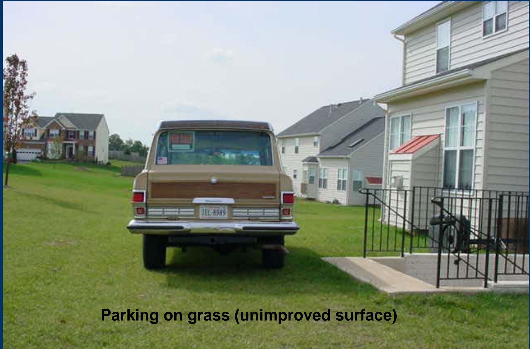
Parking on grass (unimproved surface)