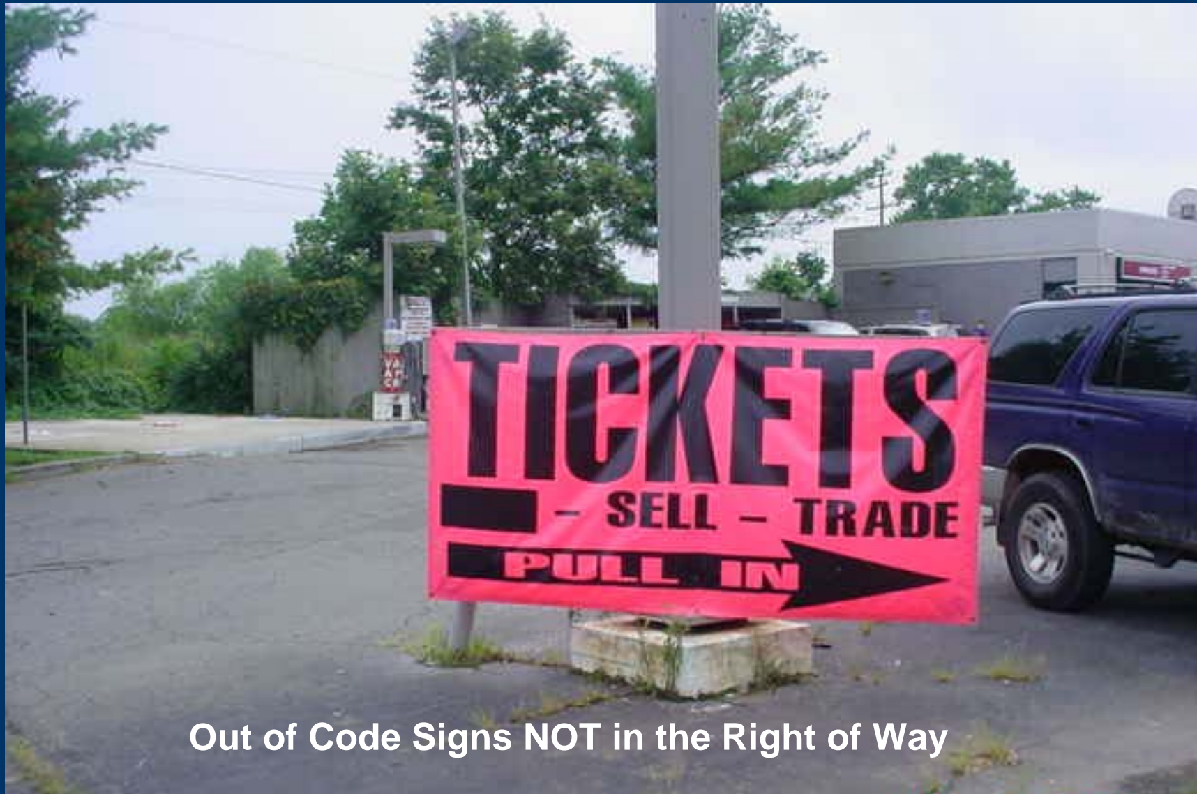
Out of Code Signs NOT in the Right of Way