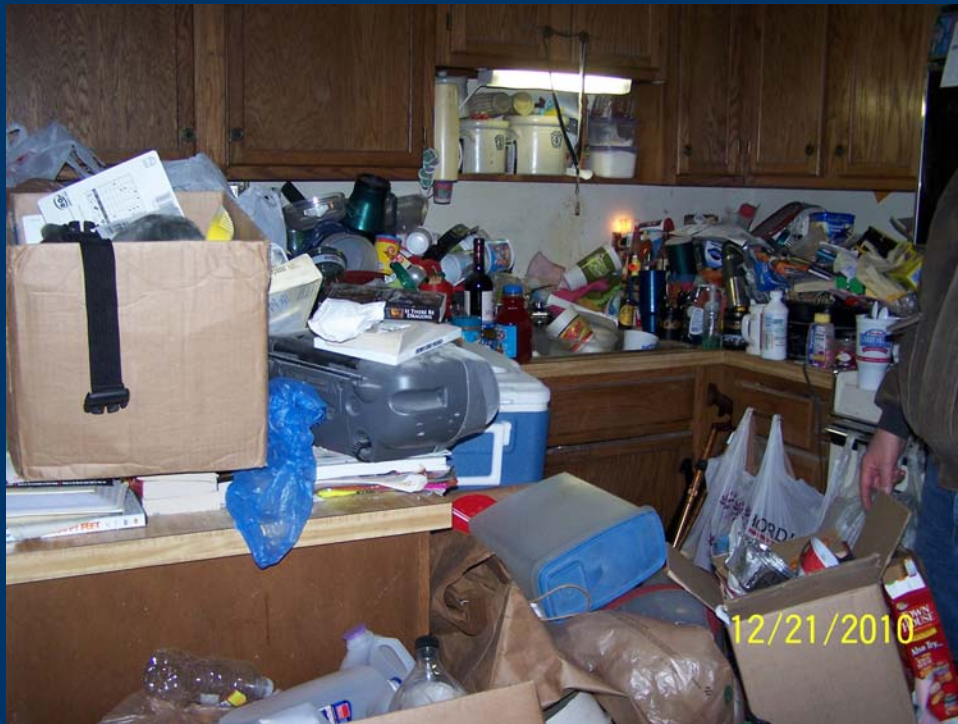
Occoquan Magisterial District—Elderly couple unable to use kitchen