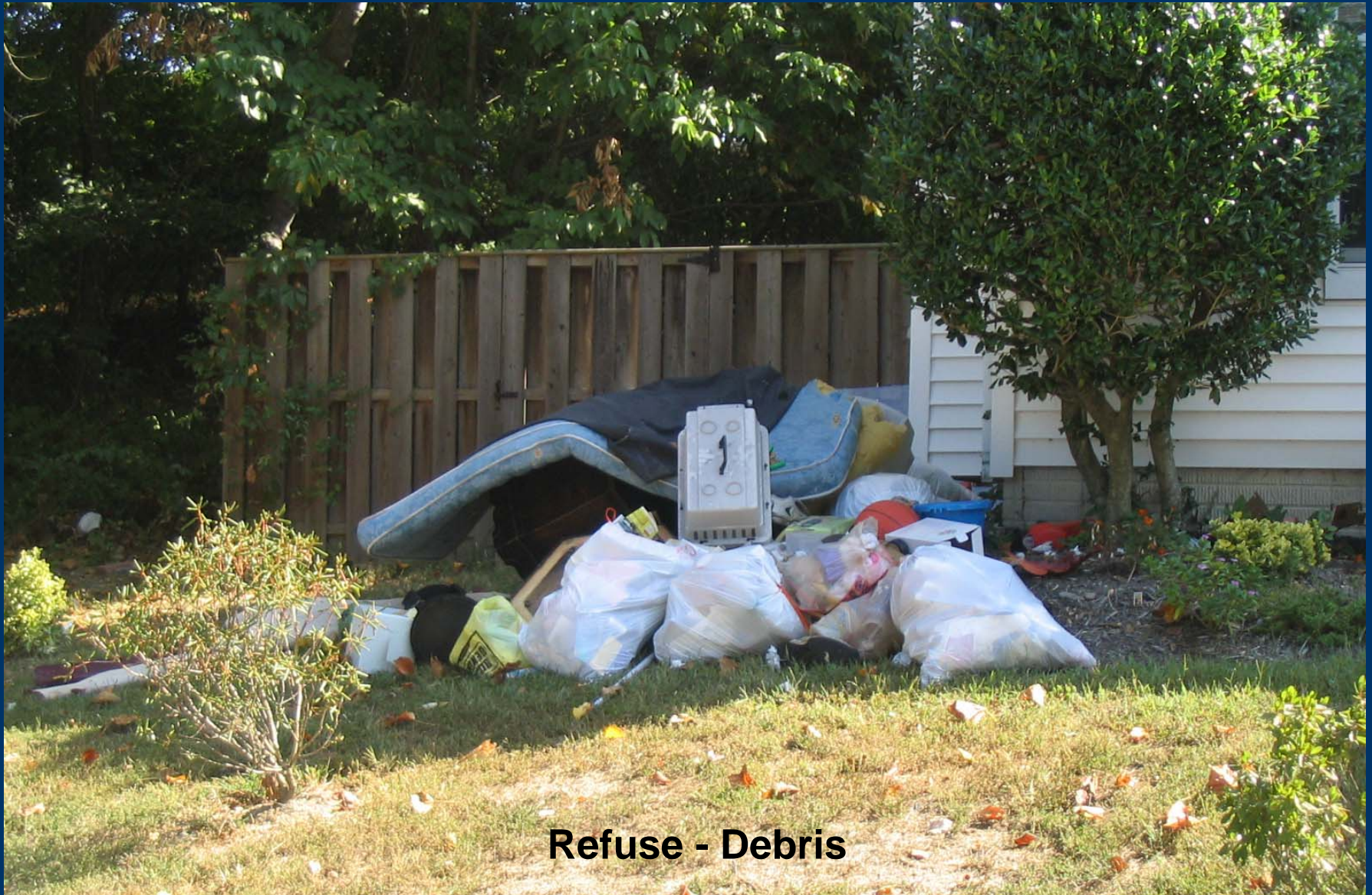
Refuse - Debris