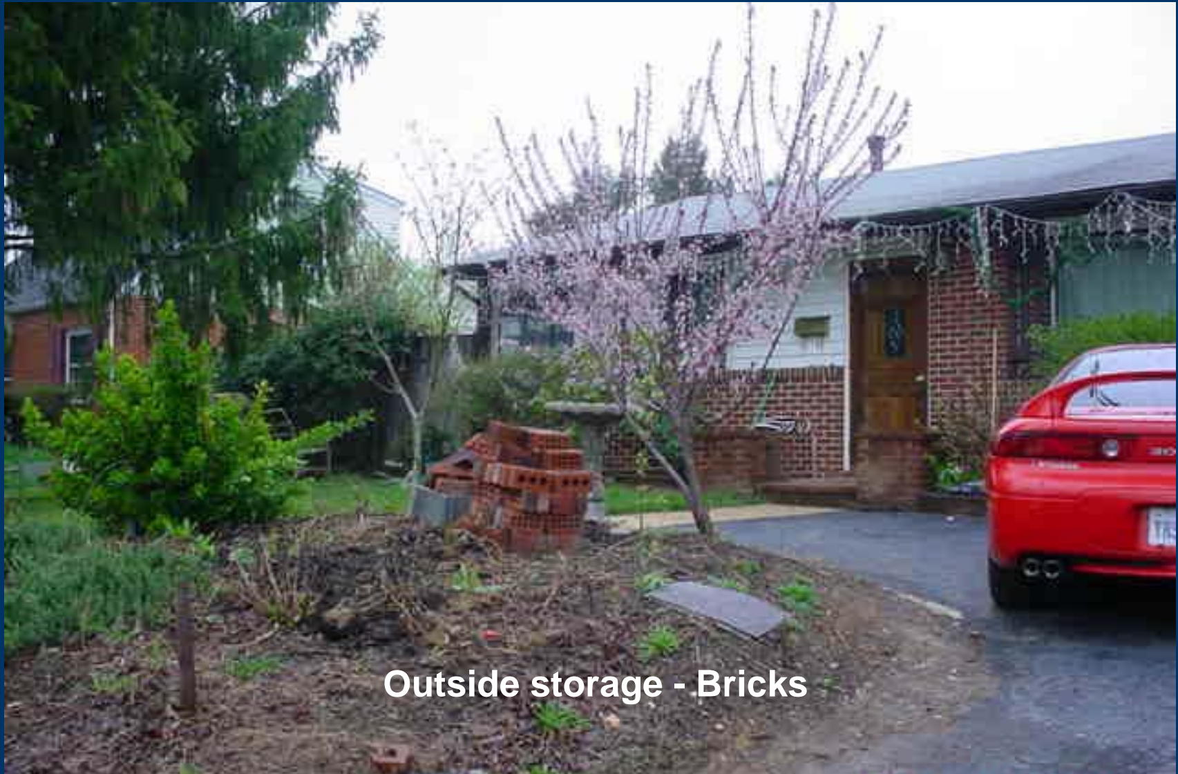
Outside storage - Bricks