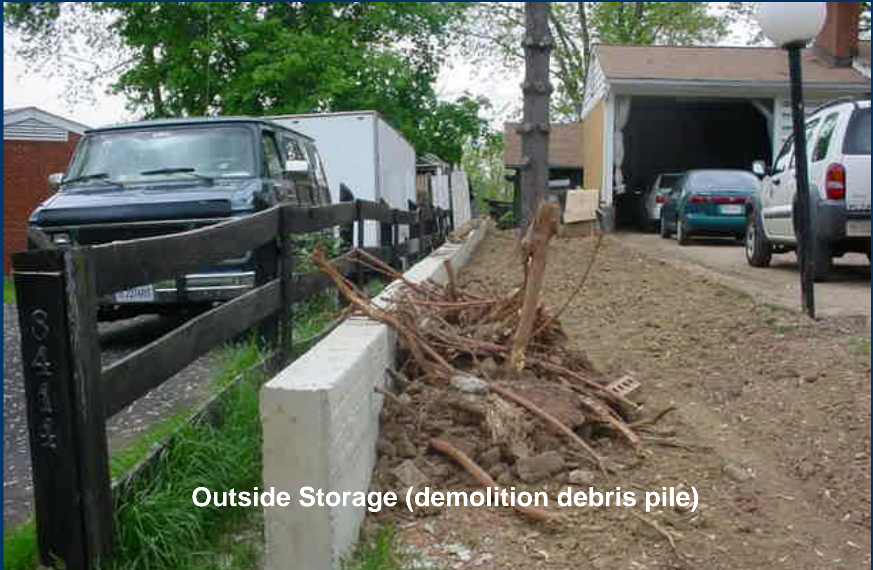
Outside Storage (demolition debris pile)