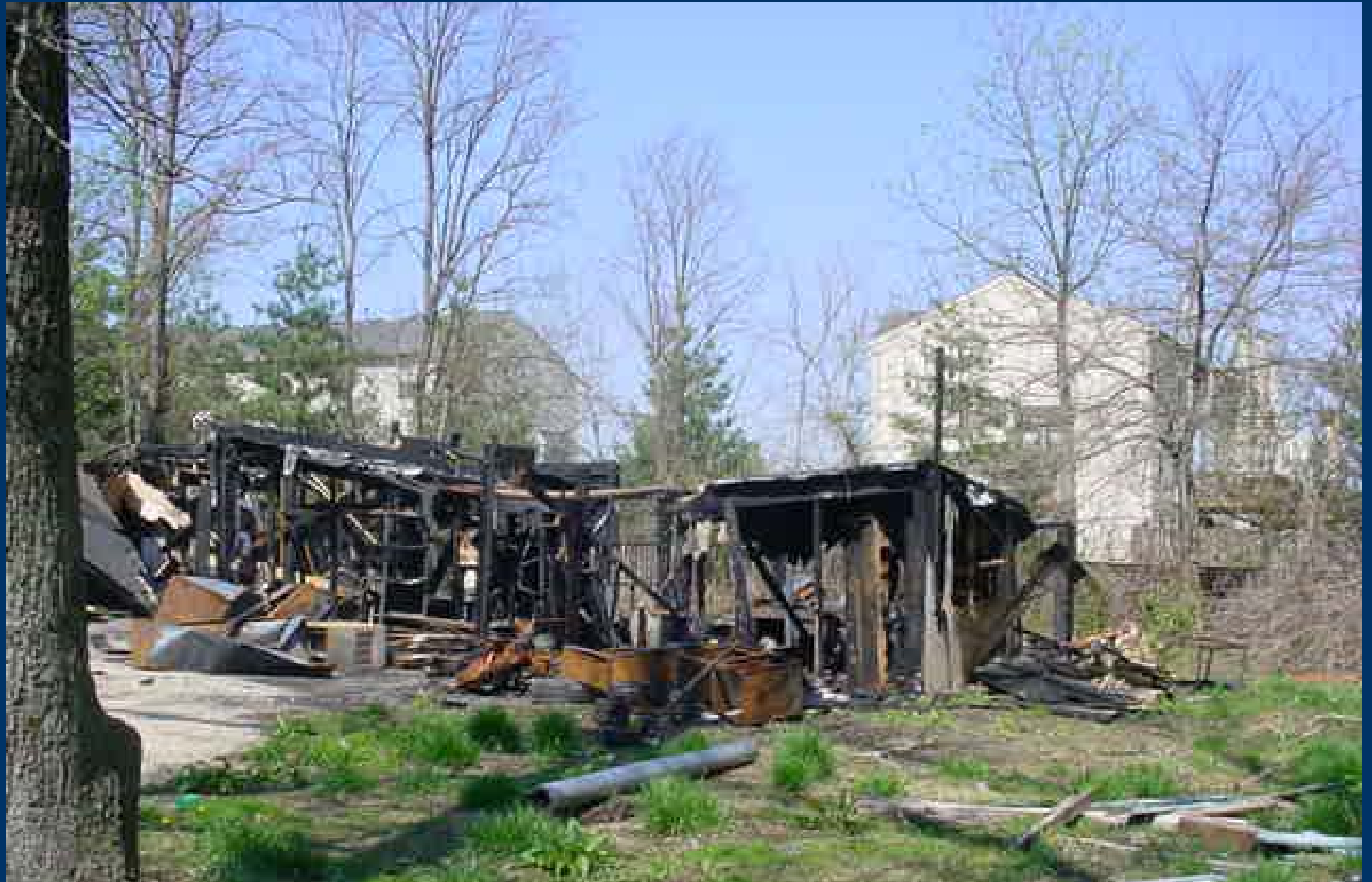
Blight properties – Fire Damage