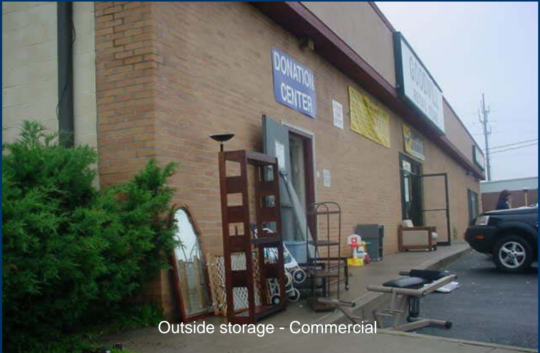
Outside storage - Commercial