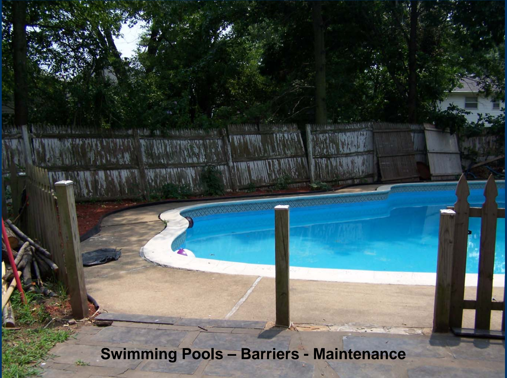
Swimming Pools – Barriers - Maintenance