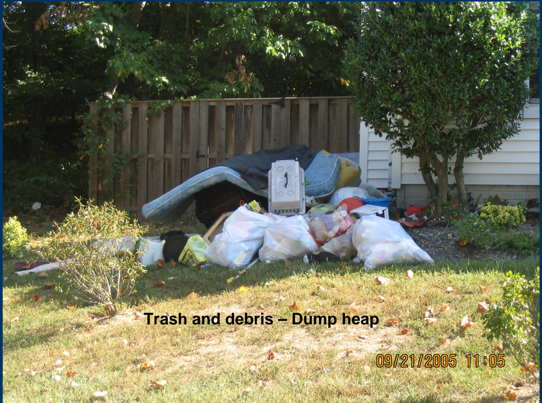
Trash and debris – Dump heap