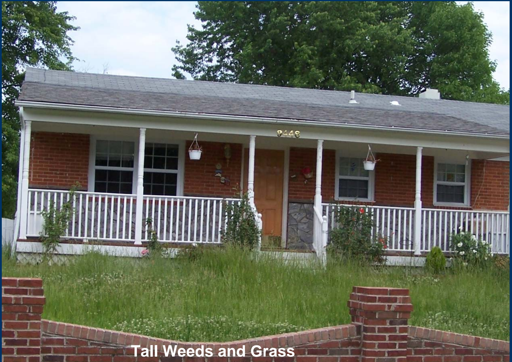
Tall Weeds and Grass