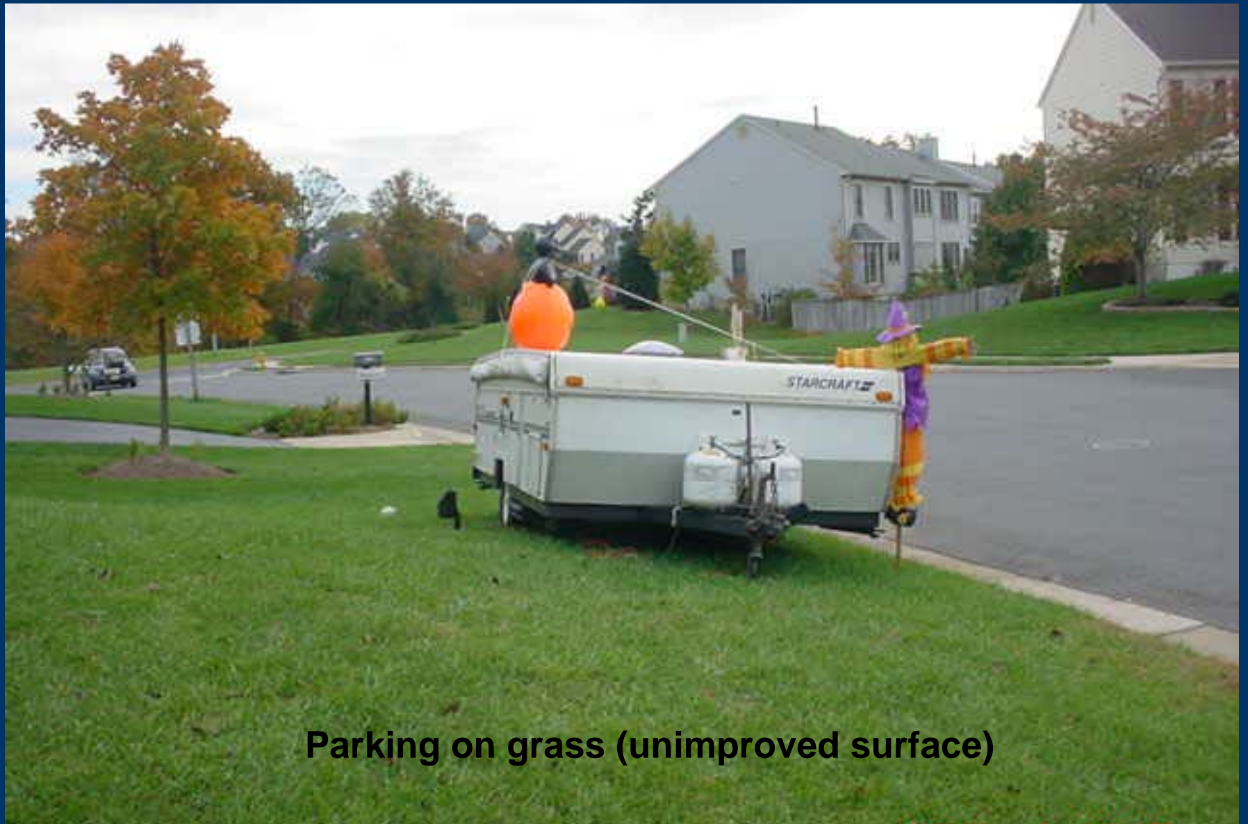
Parking on grass (unimproved surface)