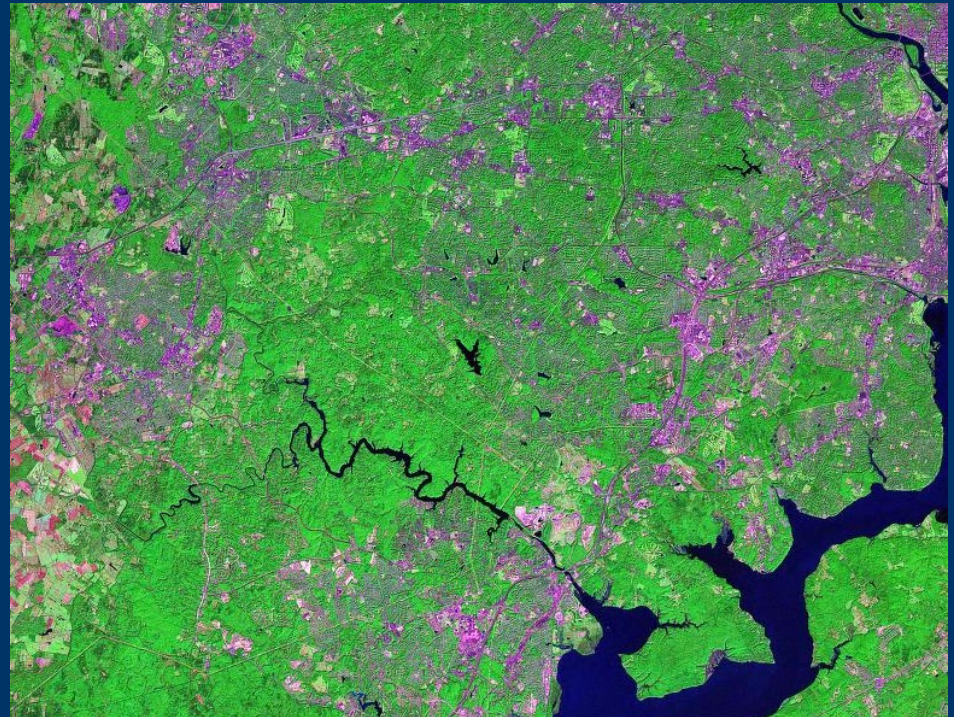
Prince William County as seen from the Space Shuttle