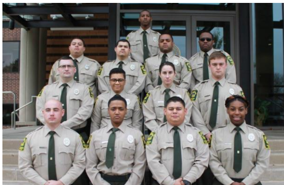
Jail Basic Academy #24 – November 17, 2017

The Prince William-Manassas Regional Adult Detention Center's Academy is a satellite training facility of the Prince William County Criminal Justice Academy. During FY 2018, the Training Section conducted two Jail Basic classes; twenty-five new Jail Officers successfully graduated.