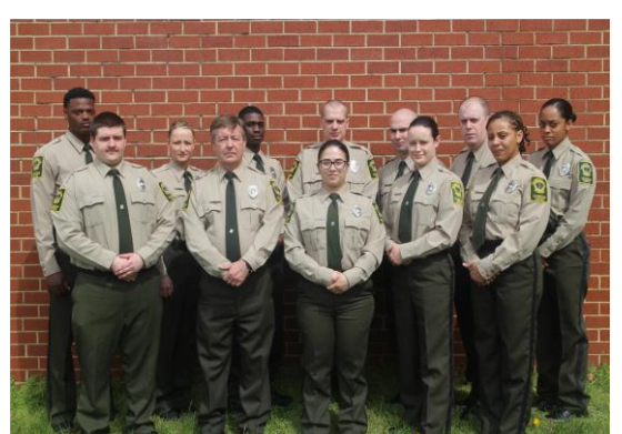
Jail Basic Academy #25 – March 30, 2018

Training continues for staff. All sworn staff met in-service objectives and annual firearms qualifications. The following are courses and mandated training requirements completed in FY 2018: