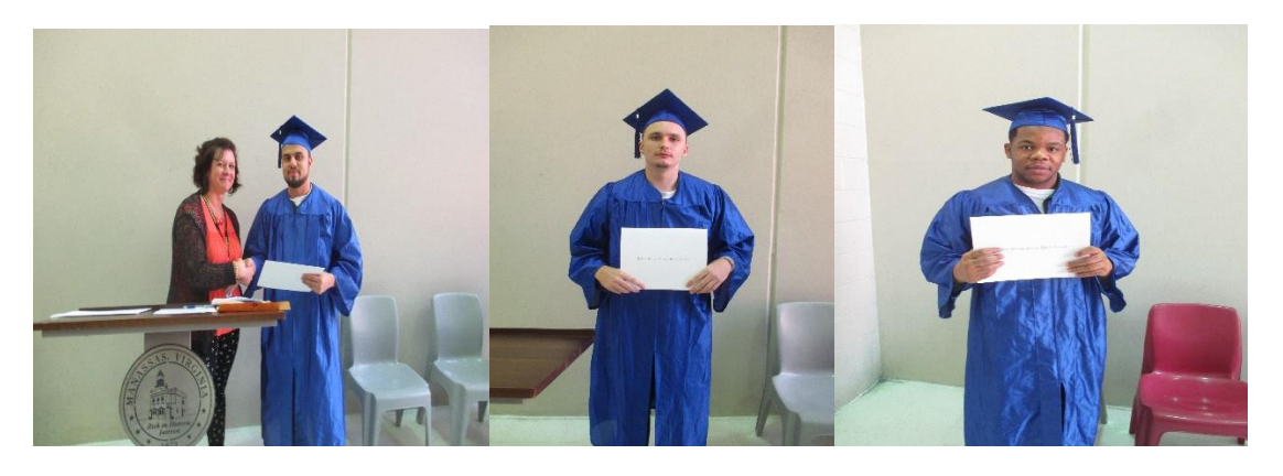
GED Graduation - August 22, 2017