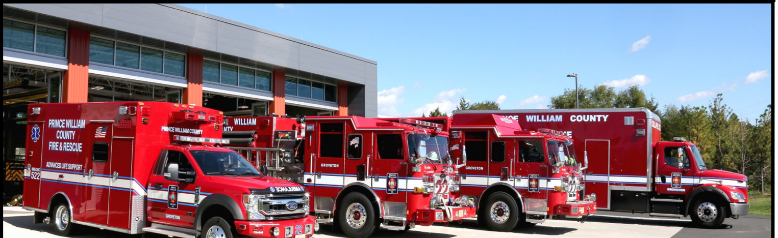
STATION 22 — PWCDFR (GROVETON)