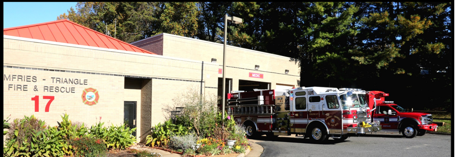
STATION 17 - DUMFRIES-TRIANGLE VFD (MONTCLAIR)