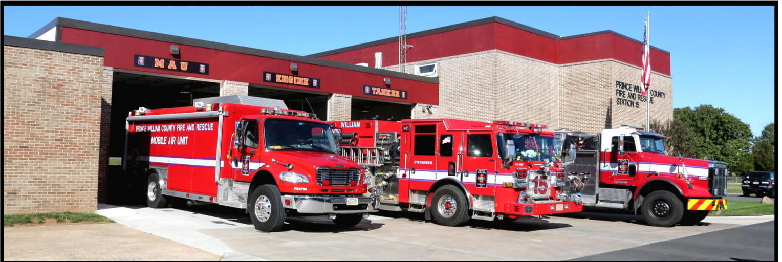
STATION 15 — PWCDFR (EVERGREEN)