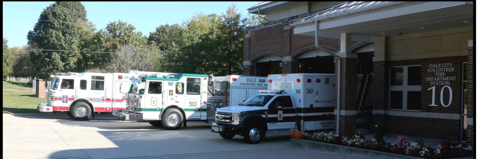
STATION 10 - DALE CITY VFD (BIRCHDALE)