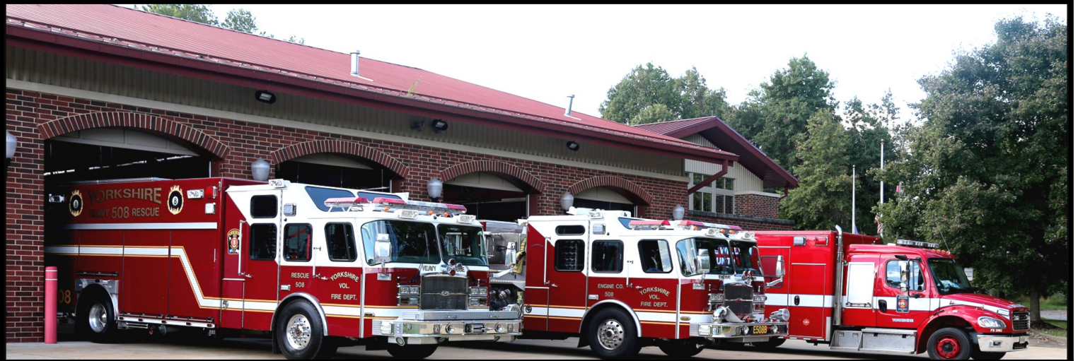
STATION 8 — YORKSHIRE VFD