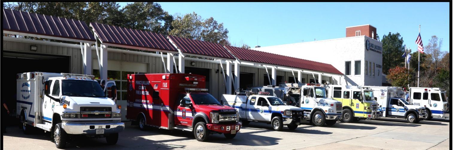
STATION 7 — LAKE JACKSON VFD