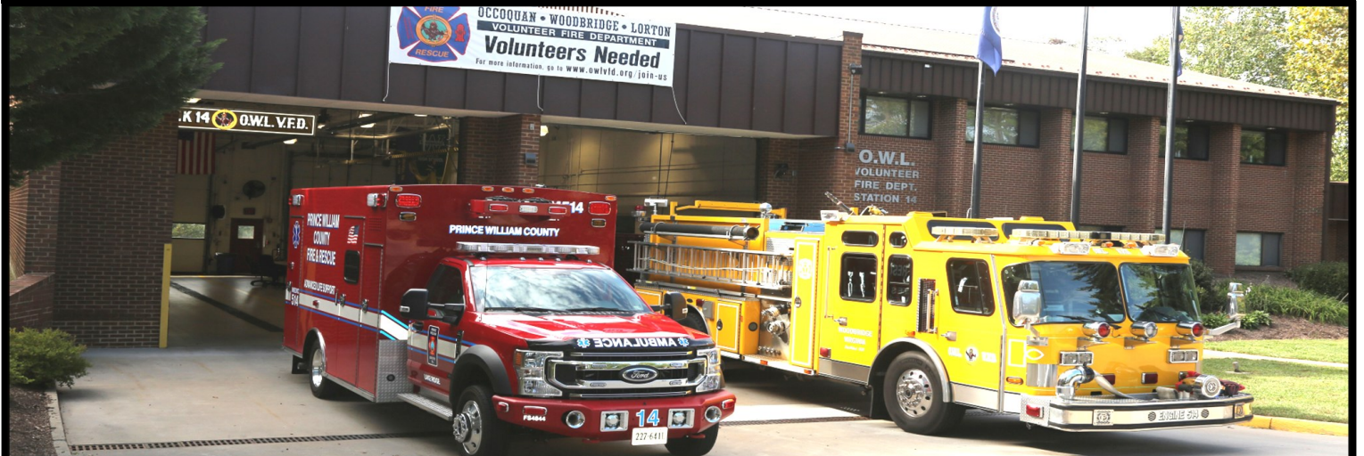
STATION 14 - OCCOQUAN-WOODBRIDGE-LORTON (LAKE RIDGE)