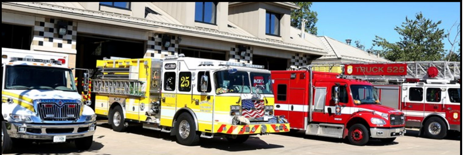
STATION 25 – NOKESVILLE VFD (LINTON HALL)