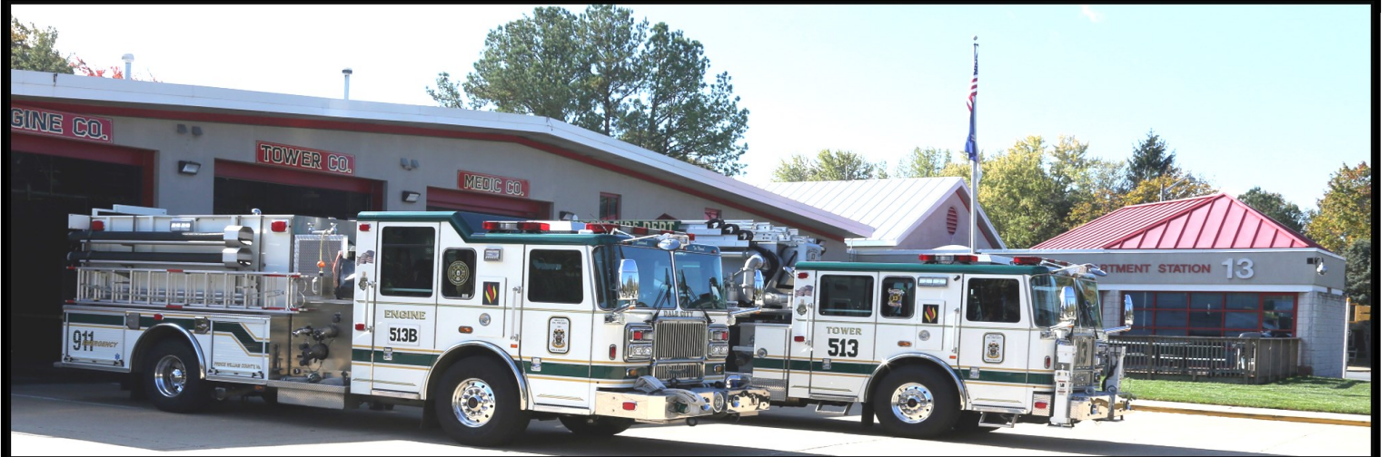
STATION 13 — DALE CITY VFD (HILLEDALE)