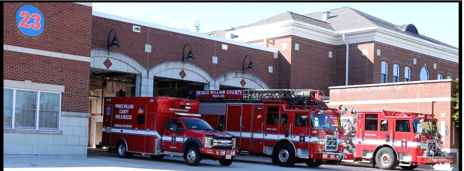
STATION 23 – PWCDFR (RIVER OAKS)