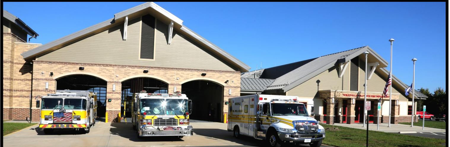
STATION 5 — NOKESVILLE VFD