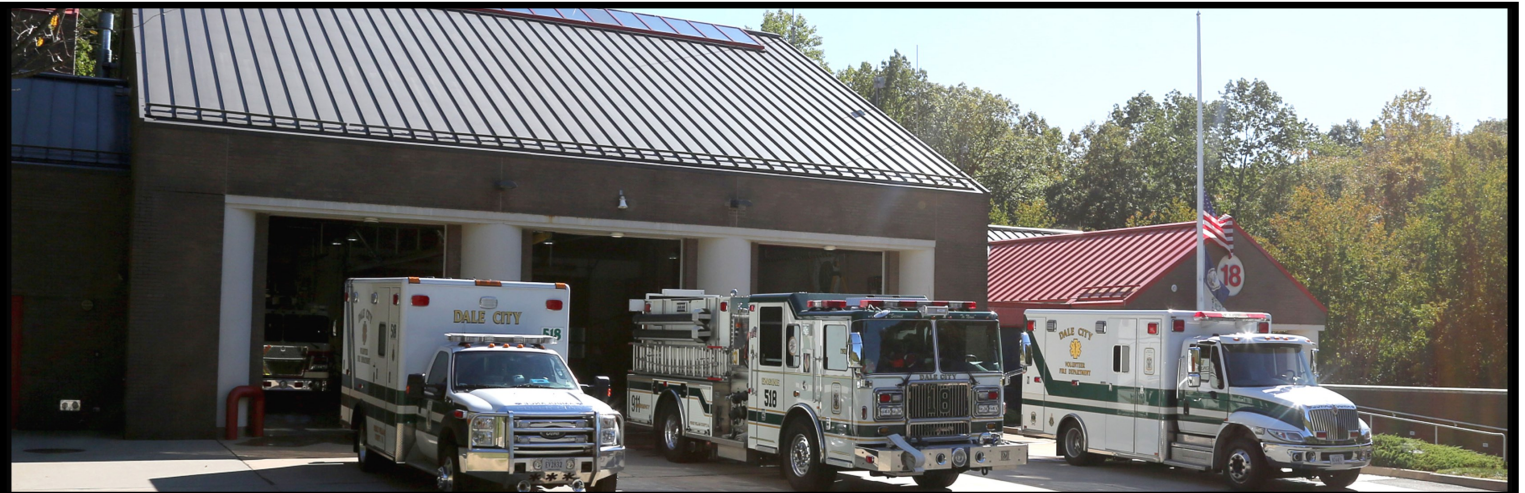
STATION 18 — DALE CITY VFD (PRINCEDALE)