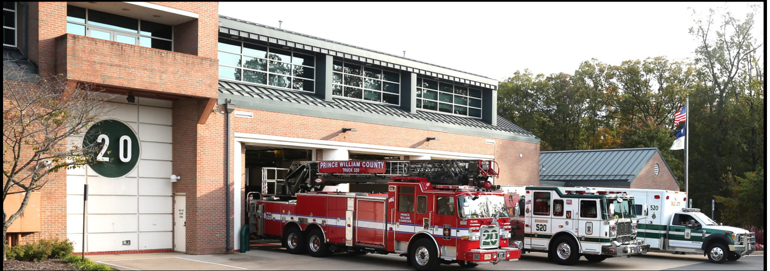
STATION 20 — DALE CITY VFD (BUCHANAN)