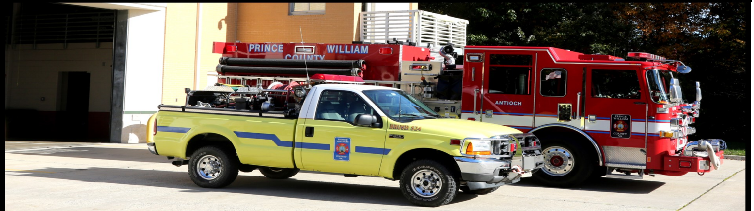
STATION 24 – PWCDFR (ANTIOCH)