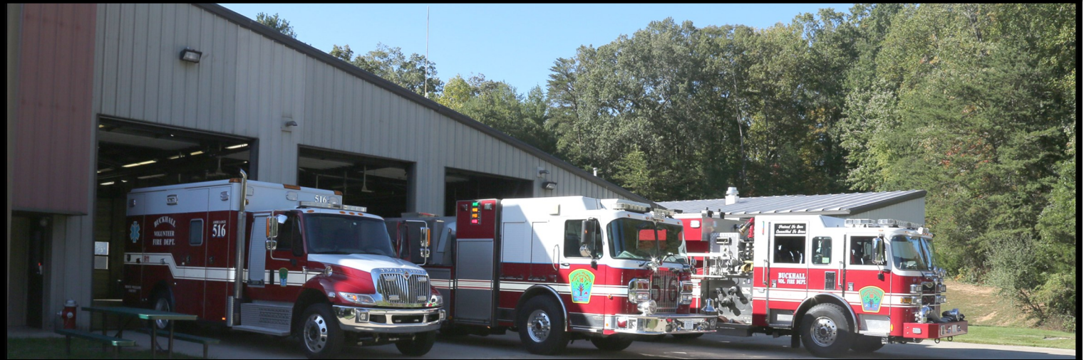
STATION 16 — BUCKHALL VFD