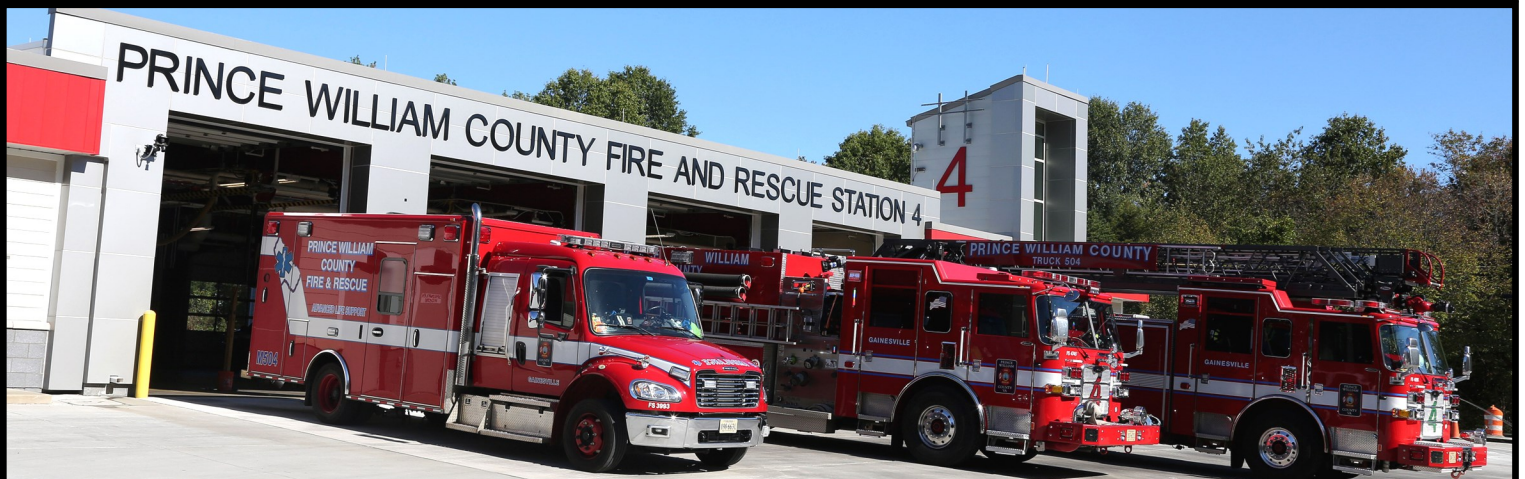
STATION 4 — PWCDFR (GAINESVILLE)