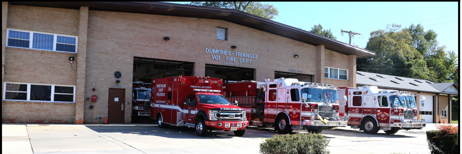
STATION 3 (3 FIRE) - DUMFRIES-TRIANGLE VFD