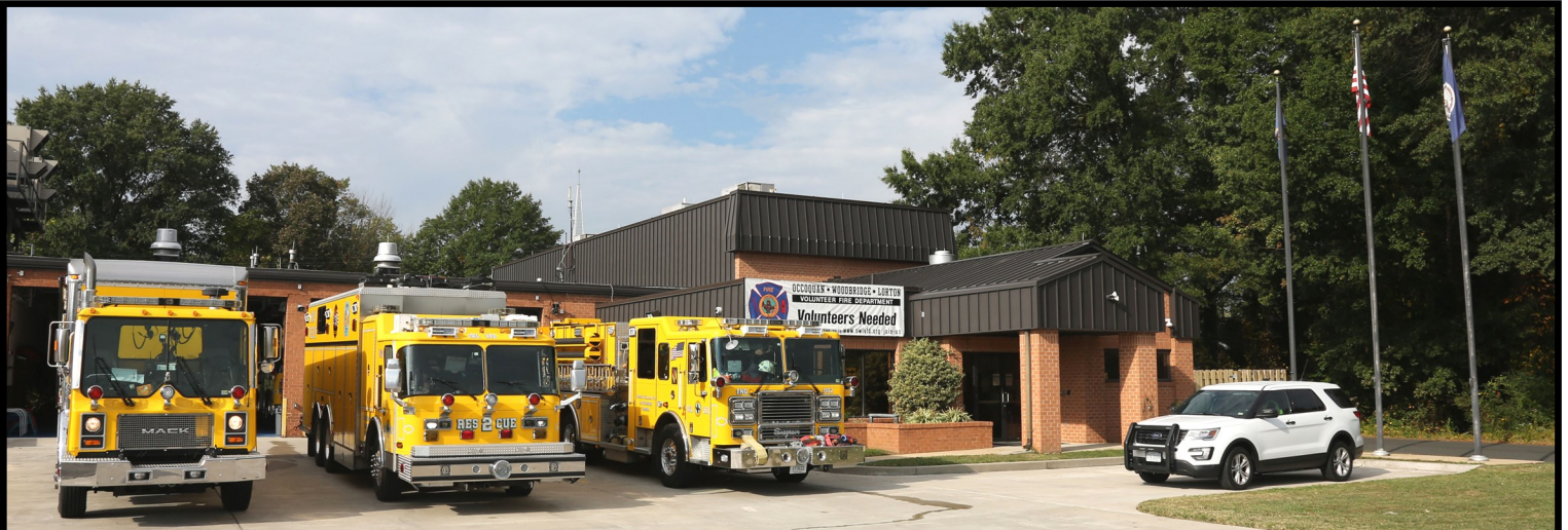
STATION 2 - OCCOQUAN-WOODBRIDGE-LORTON VFD (BOTTS)