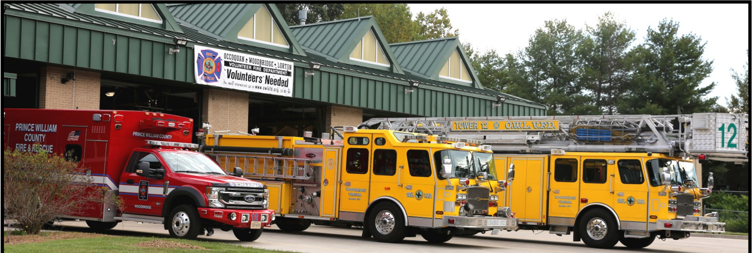
STATION 12 - OCCOQUAN-WOODBRIDGE-LORTON VFD (SPICER)