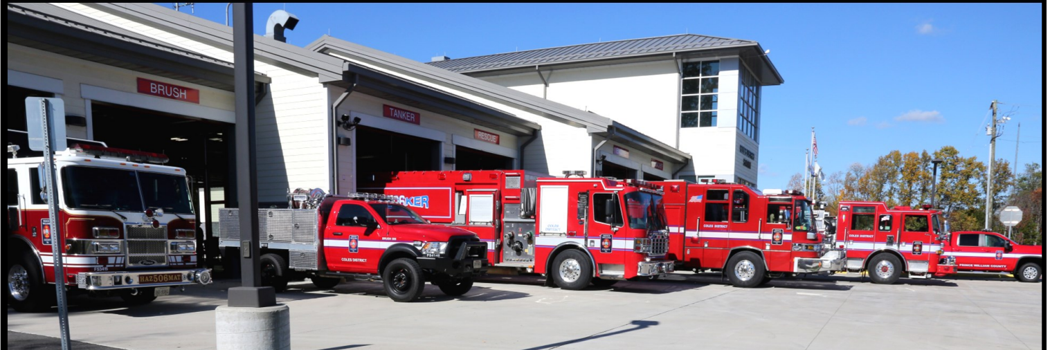
STATION 6 — PWCDFR (COLES DISTRICT)