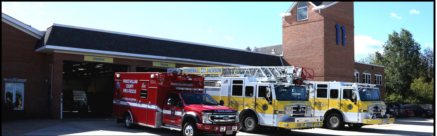
STATION 11 — STONE HOUSE VFD