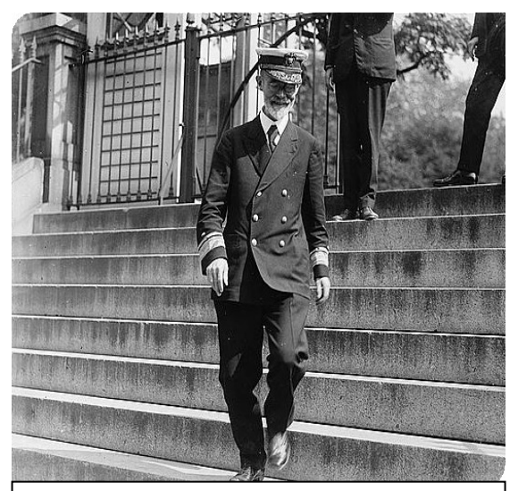
Rear-Admiral E. R. Stitt, Oct 4, 1919.

By the early 20th century the temperance movement had become a Prohibition cause. With the United States' entry into World War I it became anti-American to brew beer and other hard liquors. Beer was a German invention and brewing it was seen as supporting the Kaiser and undermining our troops. Using wheat and corn to distill liquors was seen as taking the food from starving soldiers. Public approval for Prohibition grew until, in 1914, Virginia passed a bill requiring state-wide Prohibition. In January 1918 Virginia became the second state to ratify the