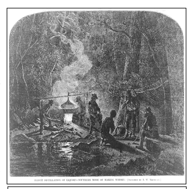
Illicit distillation of liquors--Southern mode of making whisky / sketched by A.W. Thompson.

In 1876 the Methodist and Presbyterian churches of Manassas held a mass temperance meeting to draw up a petition recommending changes in the liquor laws because "the public use of intoxicating liquors has seriously injured our reputation and prosperity as a village." The petition requested: 1) that those people currently selling liquor not apply for a license in the coming year, 2) that liquor availability be limited to drug stores for medicinal, mechanical