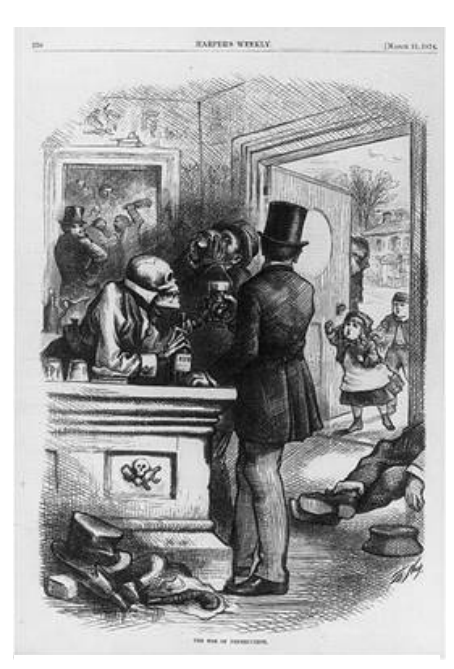
Library of Congress Digital Images Collection

It was 3 o'clock in the morning on March 26, 1919. A blockade was in place on the one-lane dirt road just past the bridge on Fisher's Hill, Shenandoah County. It was suspected that bootleggers would be making a run from Baltimore to Danville, Virginia, and the Prohibition officers were determined to catch them. An old Ford crossed the bridge and came to a sudden stop. Quickly the car reversed, attempting to make a tight turn and re-cross the bridge. Officer William C. Hall leapt onto the running board of the turning car and several shots were fired. The car veered into the embankment and came to a sudden stop. Inside the car the driver slumped over the steering wheel dead, shot twice in the chest. The passenger was mortally wounded. Prohibition officer in charge, William C. Hall and three fellow officers were arrested and charged with the murder of Raymond C.