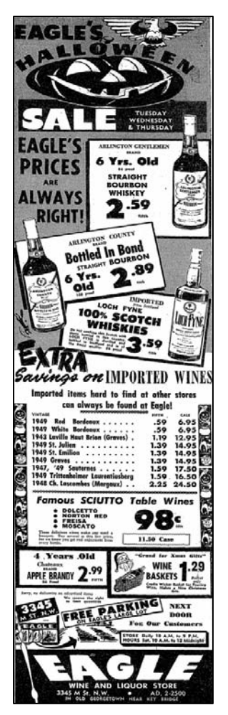
Figure 6. Ad for Famous Sciutto Table Wines, in The Washington Post , 20 Oct. 1953.

A 1953 Washington Post advertisement found Sciutto's wines sold for 98 cents a fifth or $11.00 a case. <sup>18</sup> The varietals he made were Freisa, Norton Red, Dolcetto, and Moscato. The ad is shown in Figure 6 and the wines' descriptions are provided below: