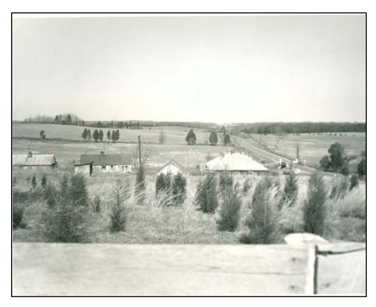
Figure 4. Photo of Sciutto Winery looking east towards Centreville, taken in 1960.