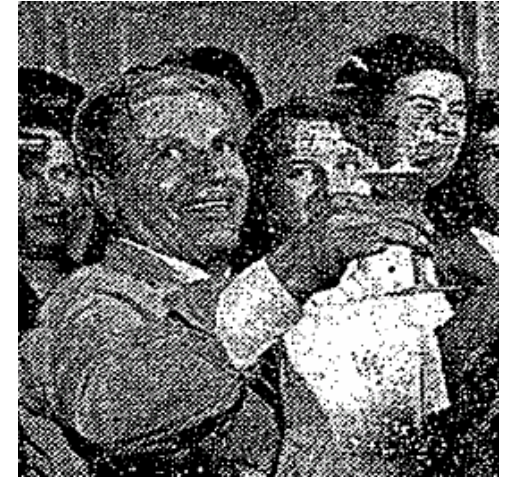
Figure 8. John Sciutto, 1953.36