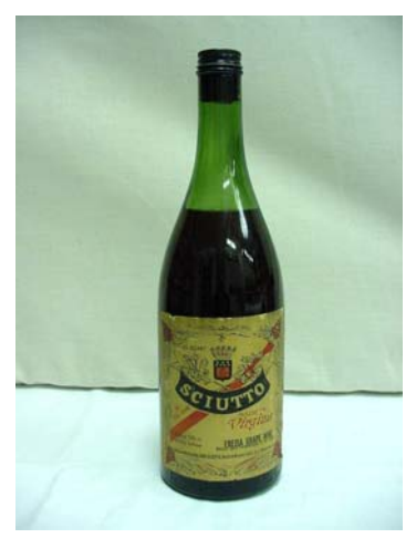
Figure 7. Sciutto Winery bottle of Freisa Wine now held at the Manassas Museum. Notice the ornate label showing appears to be a coat of arms or heraldry which has not been further identified.