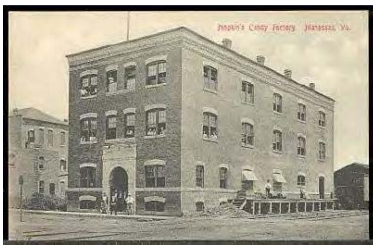
Old postcard of the Hopkins Candy Factory, Manssas, VA