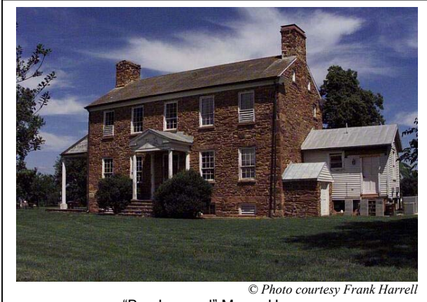
"Ben Lomond" Manor House

Many times as I have tended to my adopted rose bed behind the "Ben Lomond" manor house people who are visiting the garden would ask "Do you know who Ben Lomond was?" Well, there was no person named Ben