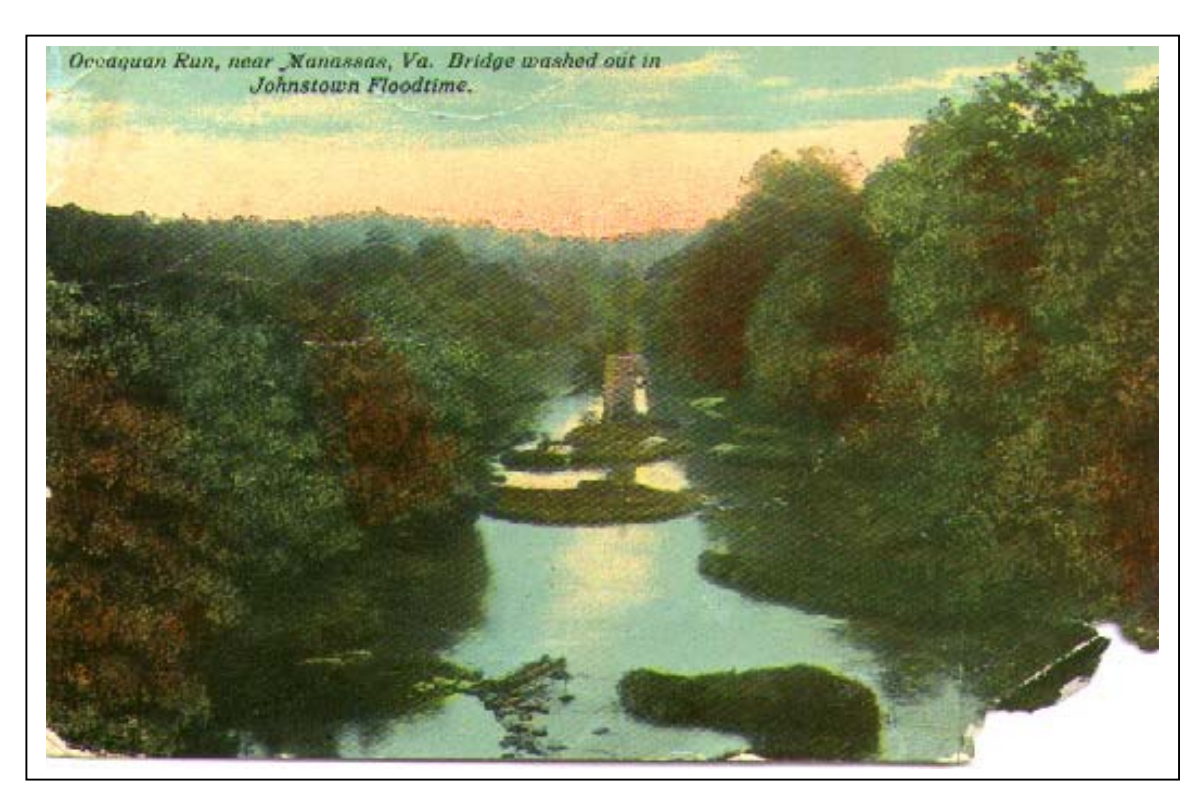
Occoquan Run, near Manassas, Va. Bridge washed out in Johnstown Floodtime - dated Nov. 1917