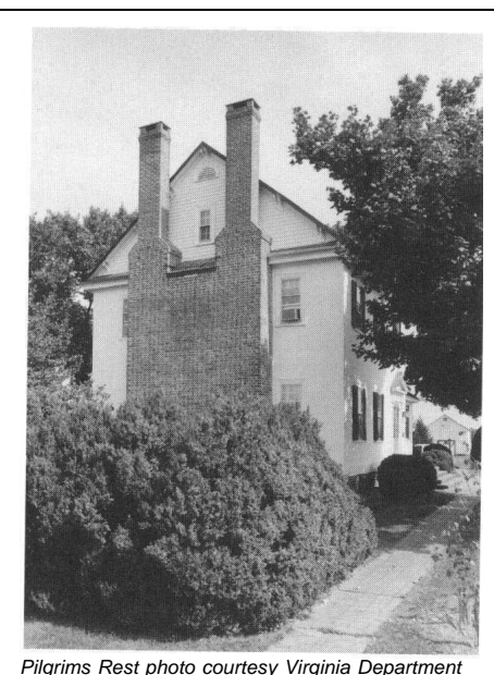
Pilgrims Rest

From the early to mid-Eighteenth Century, as the Brenton tract plantation system developed, concurrently, the port city of DUMFRIES also rose to prominence. However, an interesting combination of events, family alliances and business acumen forced a surprising shift in the balance of power, as Alexandria was also acclaimed. This juxtaposition, whether targeted or by happenstance, had a long-range effect upon the future of the Brenton region.