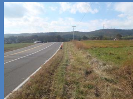
From the east end of the project looking west

Project plans and other information will remain available for review at the PWC Department of Transportation office located at 5 County Complex, Suite 290, Prince William, Virginia 22192.