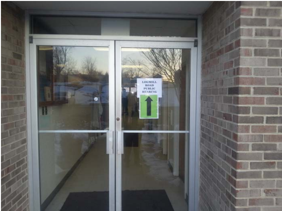
Photograph 2: Sign directing the public into the meeting room.