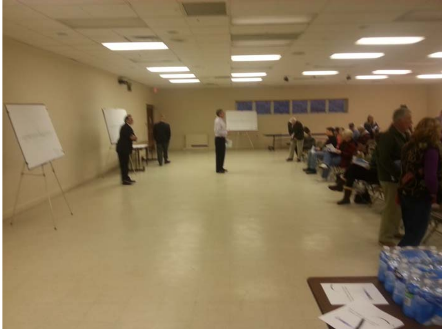
Photograph 3: Conduct of the meeting using an open forum method.