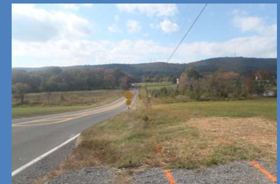
From Meander Creek Lane looking west at Logmill Road