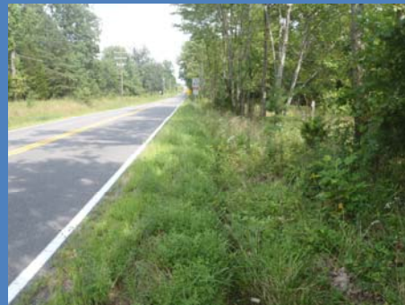
From the west end of the project looking east

On March 7, 2014 the public comment period will close. PWC staff will then review and evaluate all comments received as a result of the public hearing. Once public input has been reviewed, the project will be presented to the PWC Department of Transportation who will consider approval of the project's major design features. Upon approval of the major design features, the project will proceed to the final design phase, and given to VDOT for final approval.