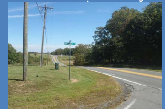
From Parnell Court looking east at Logmill Road

We look forward to working with you as the project moves forward. Thank you for coming!