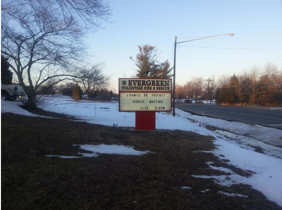
Photograph 1: Sign in front of the Evergreen Volunteer Fire & Rescue advertising for the Public Hearing.