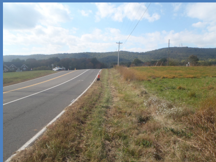
From the end of the project looking west at Logmill Road

Estimated Construction Completion Early 2014