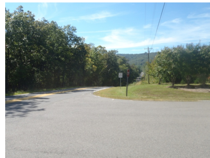
From Parnell Court looking west at Logmill Road