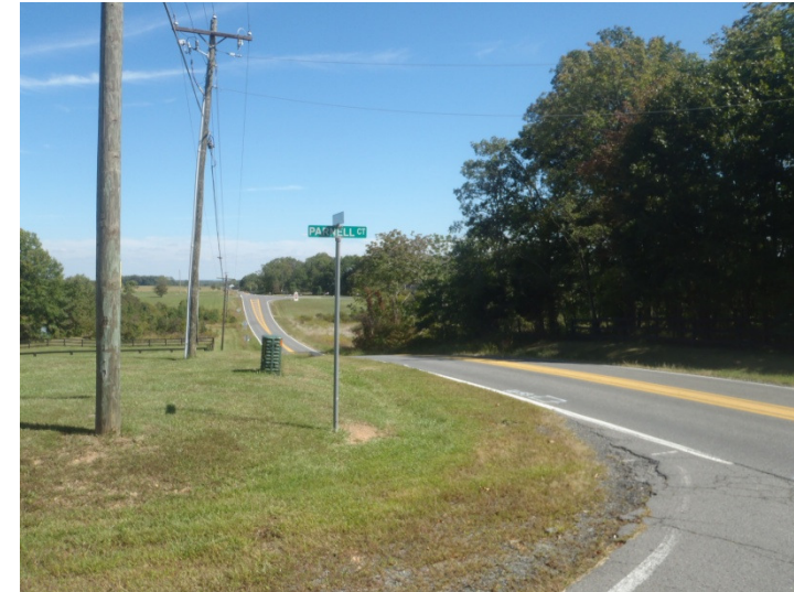
From Parnell Court looking east at Logmill Road