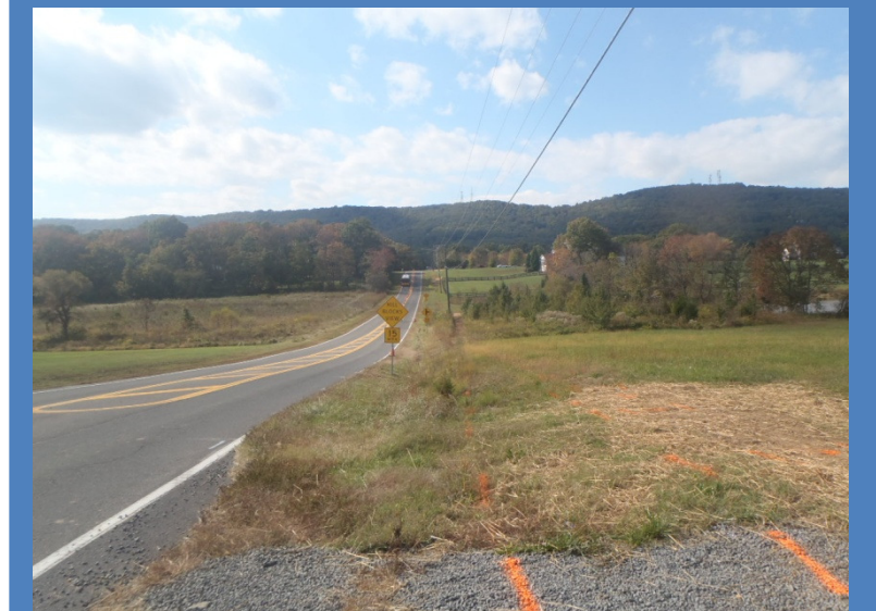
From Meander Creek Lane looking west at Logmill Road

We look forward to working with you as the project moves forward. Thank you for coming!