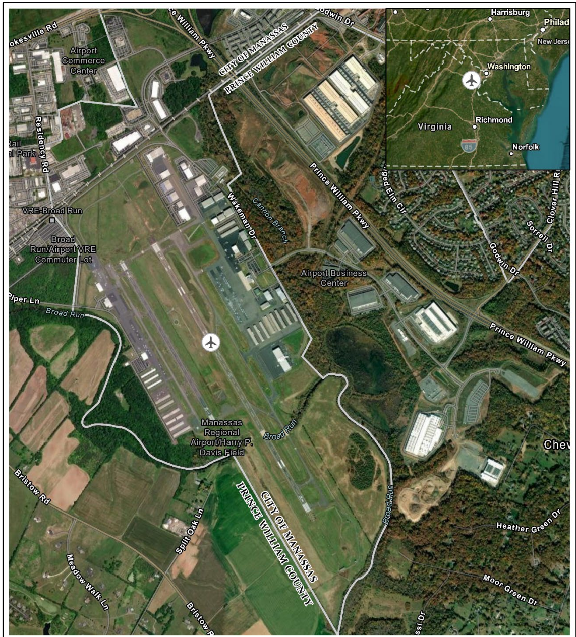
Figure 1 Airport Location