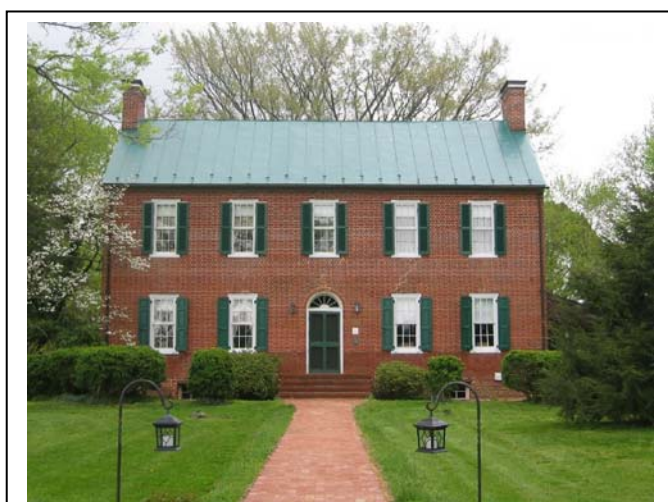
Moor Green – March 2005

Moor Green 2 is a survivor. It has been subject to a number of situations that could have caused its total destruction—fire, lengthy vacancies, vandalism, subdivision and the continuing change of the demographics of Prince William County from farmland to suburbia. It survived the Civil War intact, though several major battles were fought nearby. Because of the dedication of its resident owners, it remains a very impressive structure to this day.