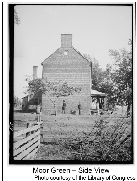
Moor Green – Side View

The lack of a resident owner continued for the next 19 years, as Moor Green was owned by a series of companies, banks and trustees. Extensive renovation of the house was planned but took years to materialize. The land surrounding the house was subdivided and house was empty. It was a very precarious time for this property. Moor Green was placed on the Virginia Historical Landmarks Register on 18 July 1978 and on the National Register of Historic Places 79 on 16 November 1978. The owner of the property at that time was